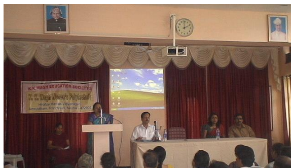
Snaps of Parent- Teacher Meet