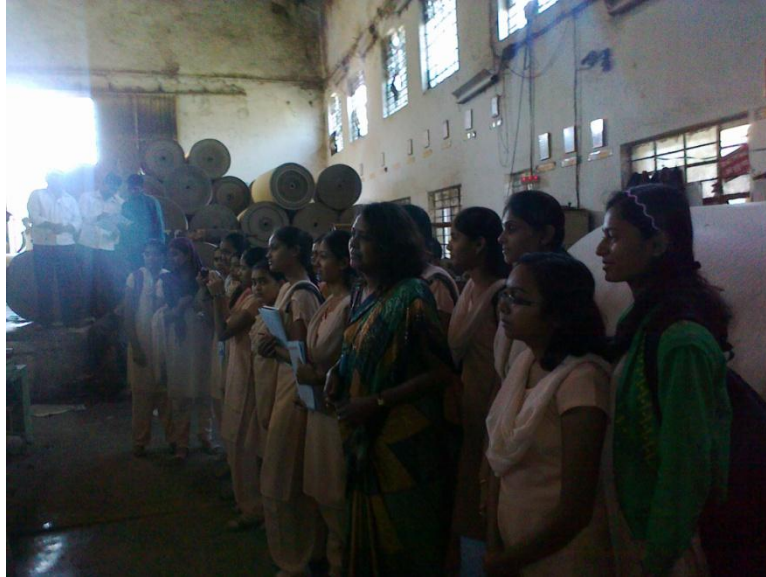
Visit to Bhikusa Paper Mill

which is heated and hardened on the conveyor belt. This result in the formation of the brown paper which is then rolled around a roller and a big role is prepared.