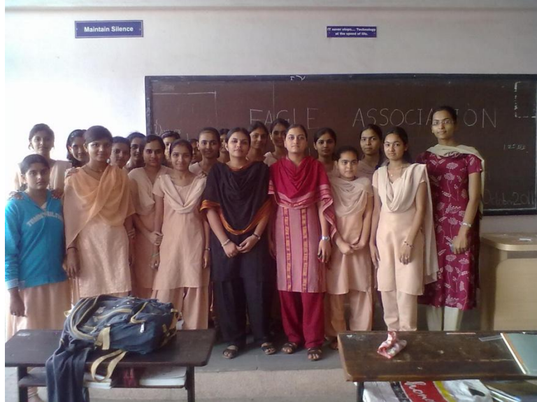
Technical Quiz Competition for SYET