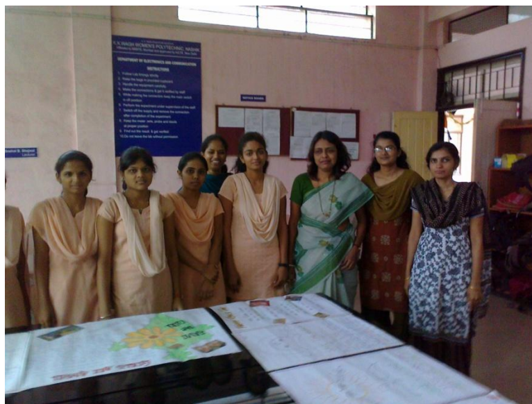
Poster Competition for SYET &TYET