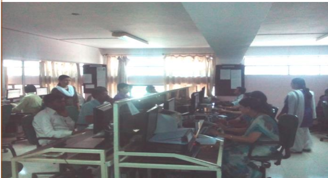
Conduction of Training Programme on 'MS-Office 2010'